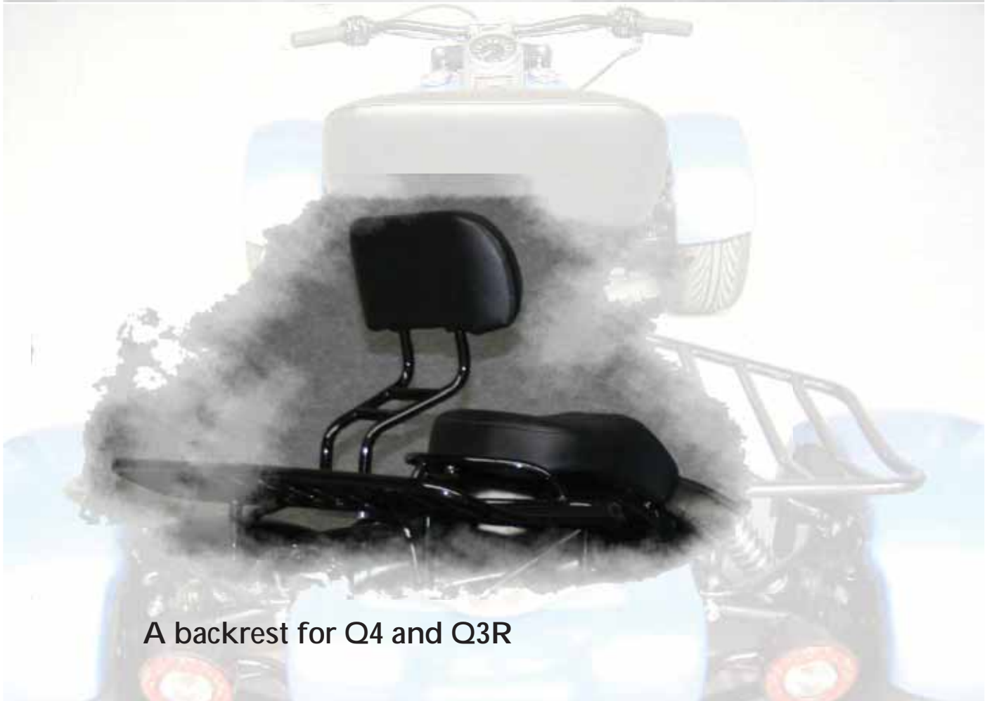
A backrest for Q4 and Q3R