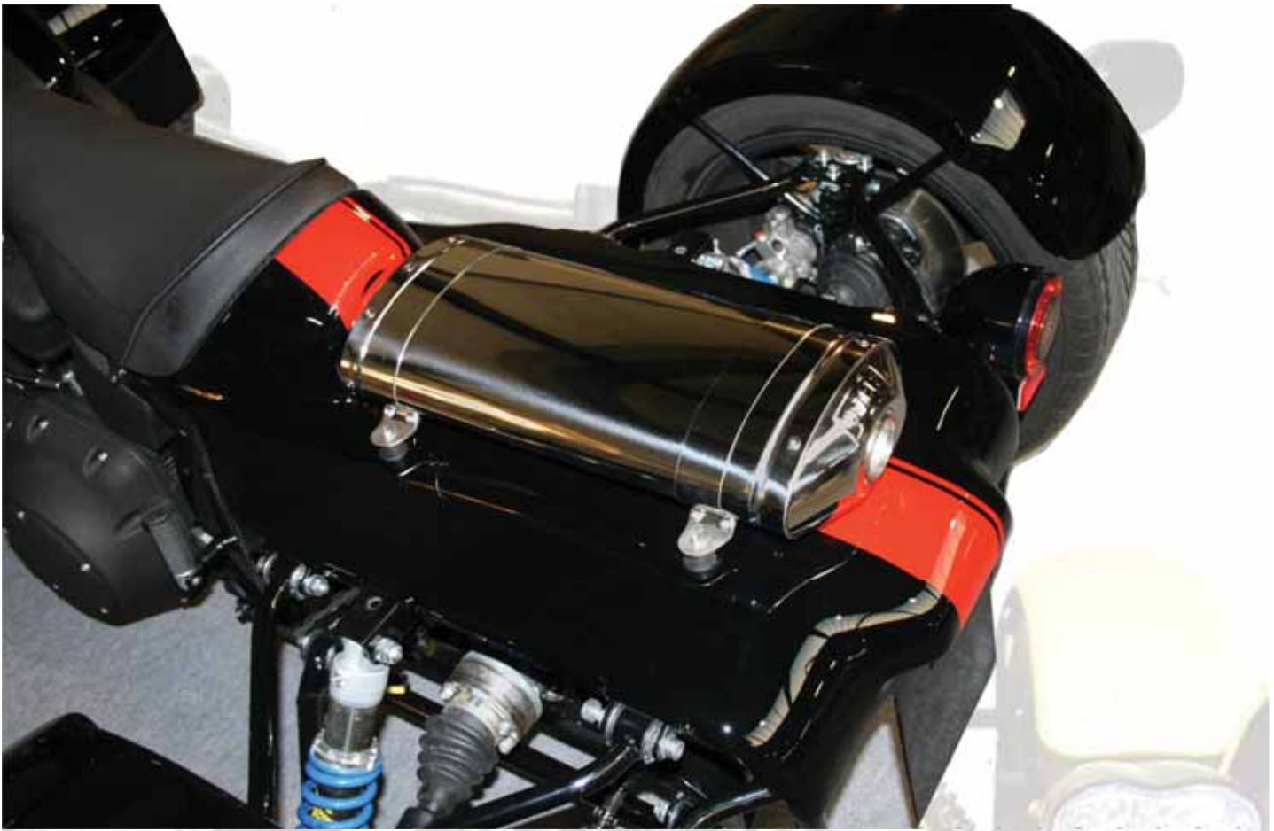
Rear cover with single or double openlook exhaust