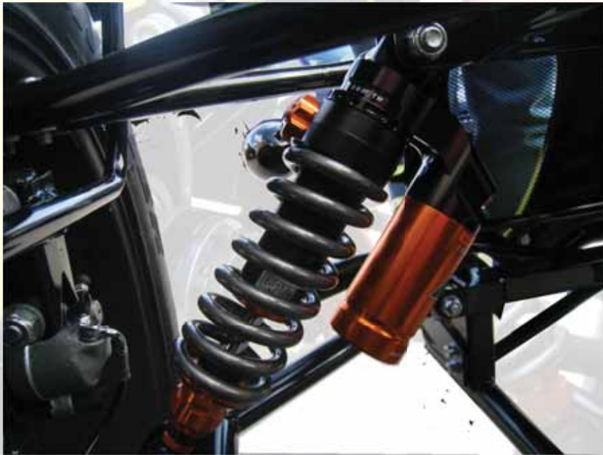
Adjustable springer for suspensions