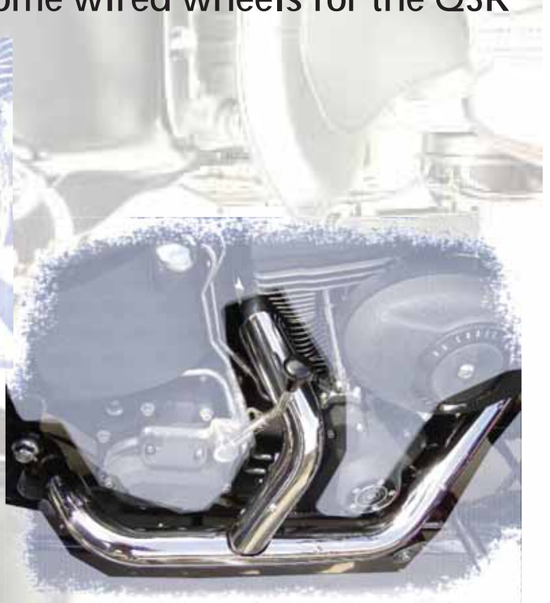
Heat shields in RVS For exhaust pipes are standard