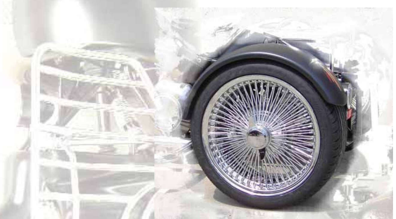
Chrome wired wheels for the Q3R